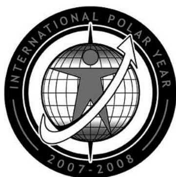
Fig 1: Proposed logo for IPY 2007-2008

There is also a requirement for simpler artwork (a logo) that can be used in colour or in a black and white form and be reduced to a very small image without losing its ability to identify IPY 2007-2008. The brief for the logo was that it should identify the polar regions, refer back to IGY but also look to establishing a legacy of significantly increased awareness of, and activity in, polar regions. It should also clearly indicate the importance of the human dimension in IPY 2007-2008. The logo shown in Fig. 1 consciously takes the original Globe logo of IGY, but highlights both polar regions, superimposes a large human figure symbolising the human dimension and replaces the original representation of an orbiting satellite with an arrow symbolising the establishment of a legacy.